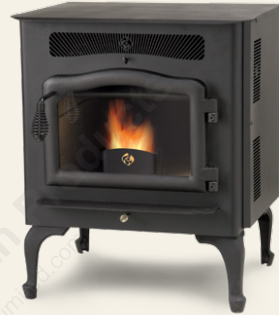
Unbeatable Heat Efficiency