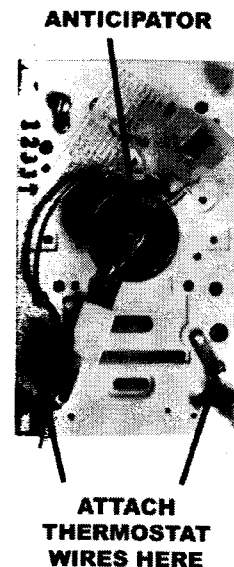
Figure 3. Thermostat wiring to the wall thermostat