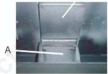
FRONT OF STOVE