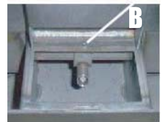
FRONT OF STOVE