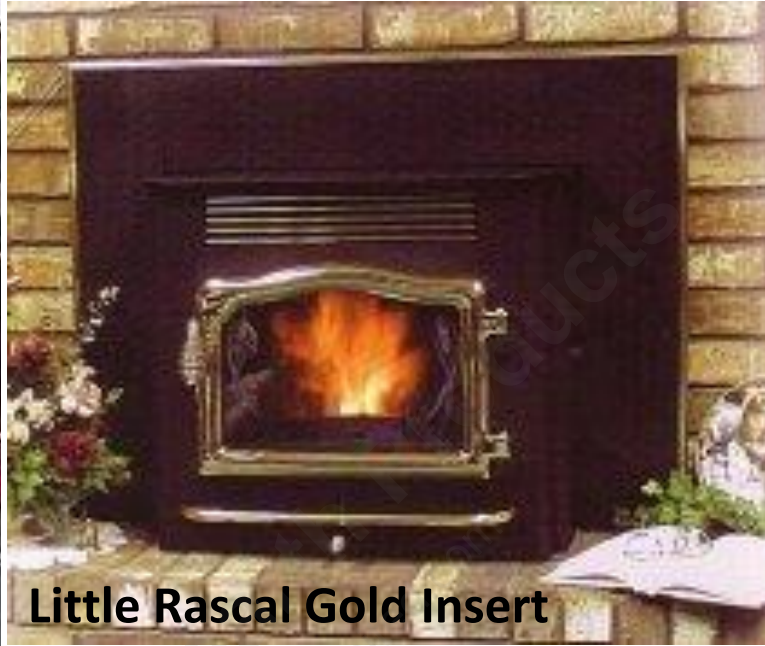
Little Rascal Gold Insert