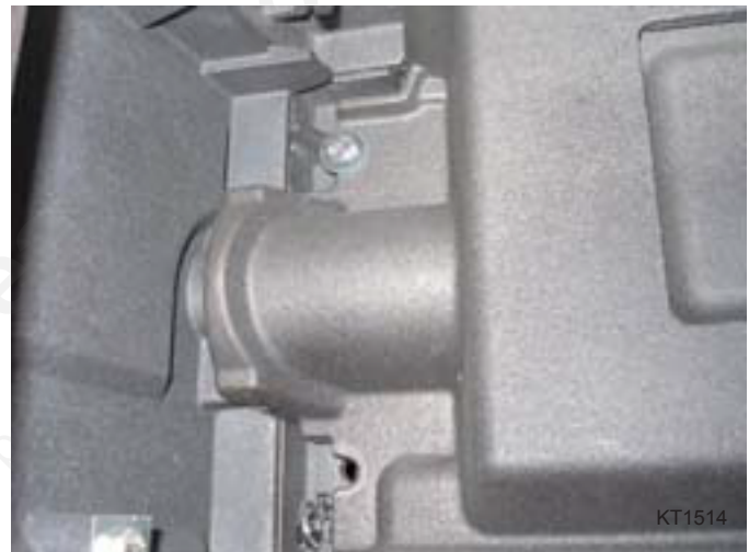
Fig. 6 Defiant damper housing with one (1) bolt removed. KT1514