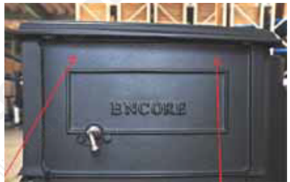
Fig. 9 Stove top that is not level.