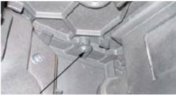
Fig. 3 Remove top bolts in rear corners. KT1511