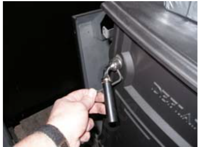
Fig. 5 Remove damper handle. KT1513