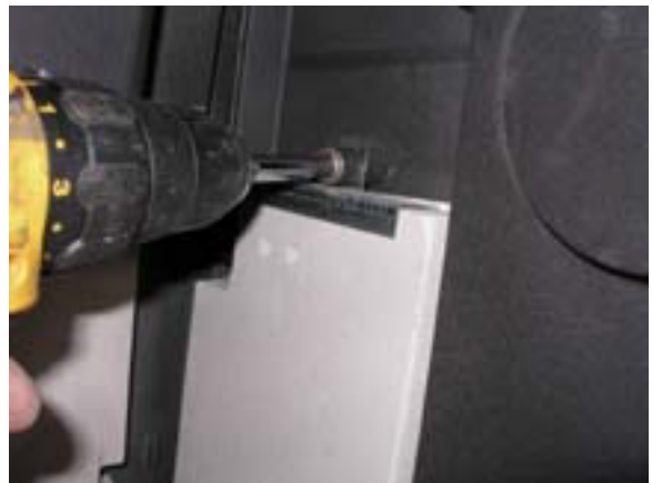
Fig. 2 Remove side brick.