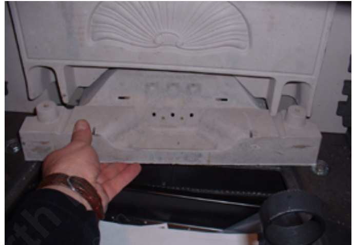
Fig. 1 Remove shoe.