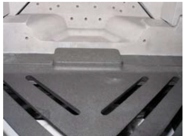
Fig. 10 Install the grate with the tab holding the shoe in place.