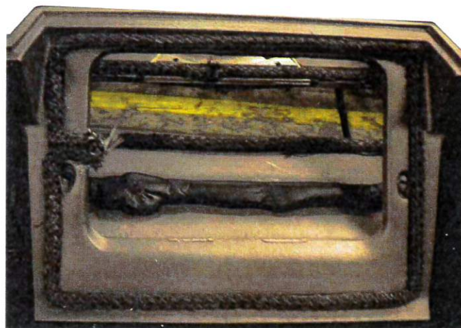
Fig. 1 Flue Collar Gasket