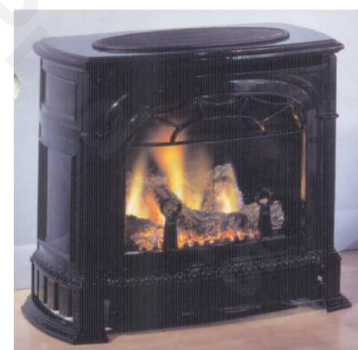
Midnight or Ebony Black

2010/2011/2012 (removed Chestnut Brown; added Majolica Brown 2010)