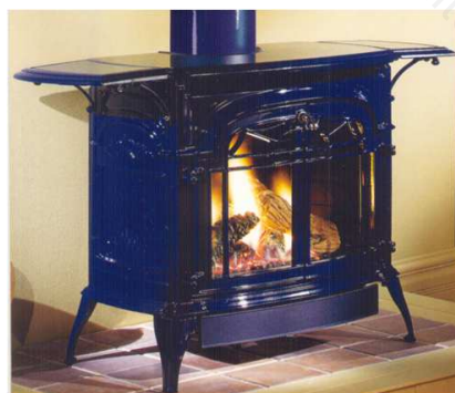
Moonlight or Midnight Blue

Bordeaux Biscuit Ebony Black Chestnut Brown