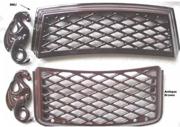
Brown Majolica (top) and Antique Brown (bottom)

Red (new) Sand Blue Midnight Black Green (Hunter)