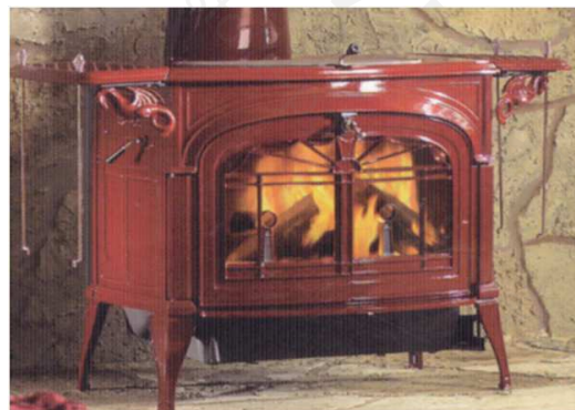
New Red or Bordeaux