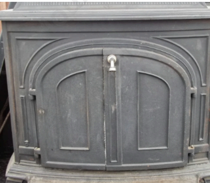
Current Handle, stub only + Fallaway Handle:

The handle is inserted into the stub when opening and closing the doors or adjusting the damper. Then it is removed and stored elsewhere. Or you can install a handle holder on one of the leg bolts to store the handle.