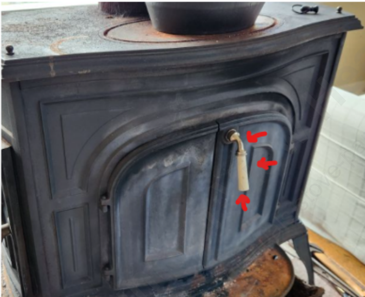
Revised Handle, 3-piece set up: